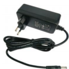
DC12V/1.5A Power Supply